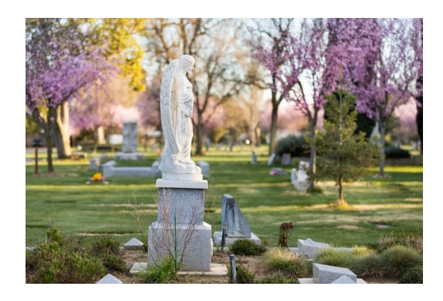
820 Pole Line Road Davis, CA 95618

Our office is open M-F 9am - 4pm Grounds are open from sunrise to sunset